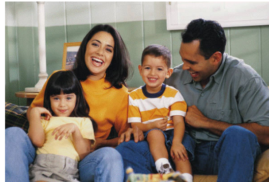
Payukotayno: James and Hudson Bay Family Services

Formal Customary Care is used to describe placement of a child considered to be in need of protection with alternative caregivers pursuant to a First Nation Band Council Declaration and /or BCR and a Customary Care Agreement that is entered into by the First Nation, family and Payukotayno. Customary Caregivers receive a subsidy equivalent to agency Foster Care rates and the placement is supervised by Payukotayno. Though the child is in care of Payukotayno "Days in care" DO NOT count